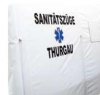
Individual marking and lettering