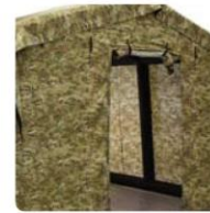
Individual colours / multi-coloured tents