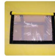
Window with mesh net / polyglass