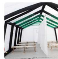
Transverse and longitudinal walls