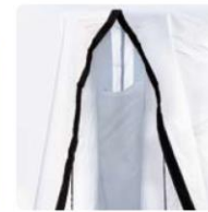
Type and method of docking