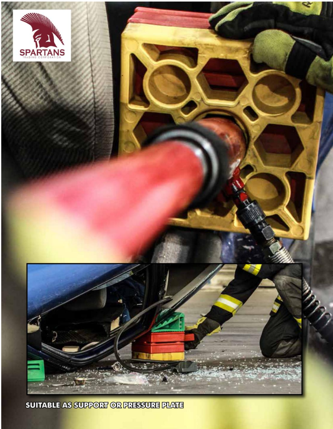
SUITABLE AS SUPPORT OR PRESSURE PLATE