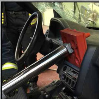
CAN BE USED WITH RESCUE RAM OR SPREADER